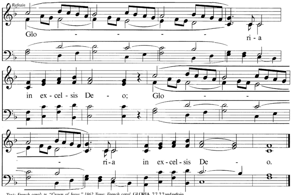
Text: French carol; tr. "Crown of Jesus," 1862 Tune: French carol GLORIA 7777 and refrain